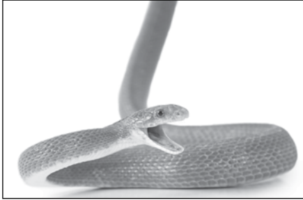
Texas Rat Snake