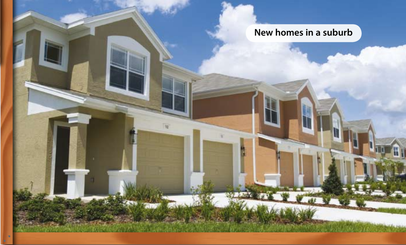
New homes in a suburb

Sometimes, whole new suburbs are created beyond the original suburbs. These may be quite far from the city. They have schools, parks, factories, offices, and shopping malls. Each of the buildings in these new suburbs is carefully planned and measured.